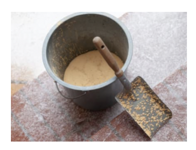
Sand for Seniors

"Sand for Seniors" is a program where members of public safety bring a bucket of sand to a senior citizen who is not able to sand their icy walkway on a regular basis due to disability or being home-bound. The program is a collaborative effort that includes Lowe's, the Knox County Deputy Sheriff's Association Lodge of Fraternal Order of Police #700, and local town offices. The program gets a member of public safety in contact with seniors who most likely are in need of services but do not reach out for them.